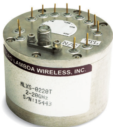
2. The MLXS-T Series of low-noise YIG-tuned oscillators covers a broad frequency range in two bands, switching between the lower- and higher-frequency bands by means of TTL control.