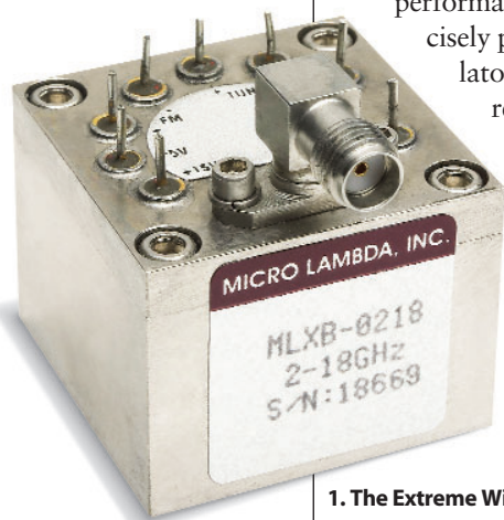
1. The Extreme Wide Band Series of YIG-tuned oscillators includes models in cube and cylindrical package types with fundamental frequency ranges of 2 to 18 GHz and 2 to 20 GHz and outstanding phase-noise performance.

In order to produce output levels meeting the requirements of the many applications mentioned above, YIG oscillators incorporate transistors to boost the signal level of the final output signals. Bipolar transistors were once the active devices of choice for this function, but the development of higher-frequency YIG sources reaching beyond 20 GHz has prompted the use of GaAs field-effect transistors and, more recently, silicon-germanium (SiGe) transistors to take advantage of the excellent low-noise perfor-